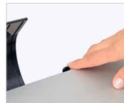
Paper pressure adjustment.