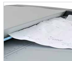
Fail-proof funnel-shaped paper feed for ease of paper insertion.