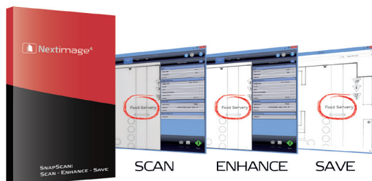
Optional Nextimage Scan+Archive More file formats and improved image controls.