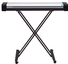
Optional Stand for easy moving and storing.