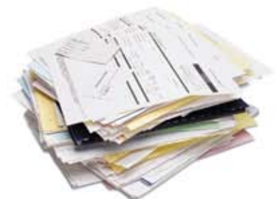
Legal and A4 Size Documents Contracts • Forms • Invoices