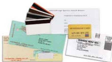
Thick and Stiff Documents Stuffed Envelopes • Plastic Cards • Cardstock