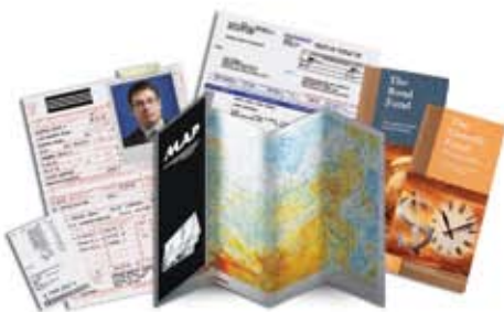
Exception Documents Receipts • Folded Documents • Photographs