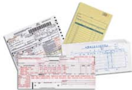
Fragile and Thin Documents Rice Paper • Airbills • NCR Forms