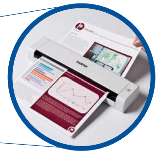
2-Sided (duplex) scanning