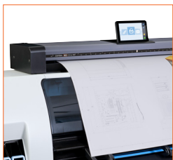
SD One MF is light enough to be placed on any flat surface like a printer.

Perfect for situations where you need to allocate costs, SD One MF has integrated print management software, allowing you to track the cost of every scan, copy or print.