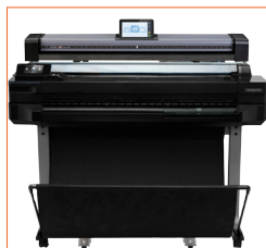
Optional high stand to place over printer.