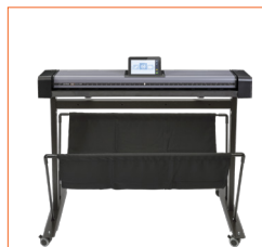
Low stand for side-by-side